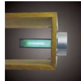
Typical view of an installation within the duct.

activTek INDUCT 750 can be installed in any HVAC system directly into the “plenum” or directly above the air handler in remote or “down stream” locations.